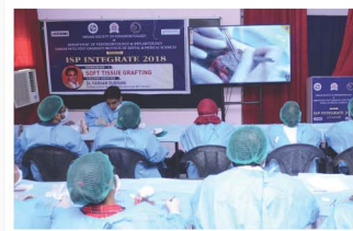
Conference, Conventions & CDE