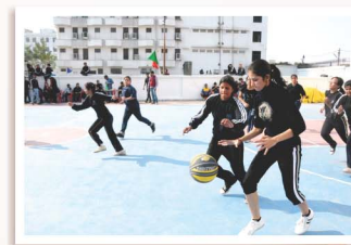
Cultural and Sports Events